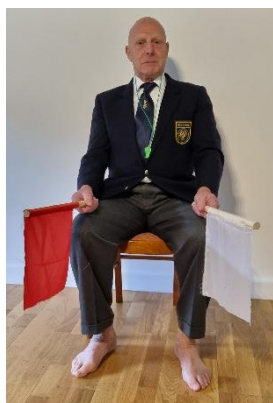
Formal Sitting Position