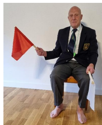
Waving up and down (Foul)