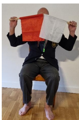
Me ga Mienai (unsighted)