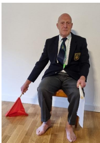
Tapping the floor (Jogai)